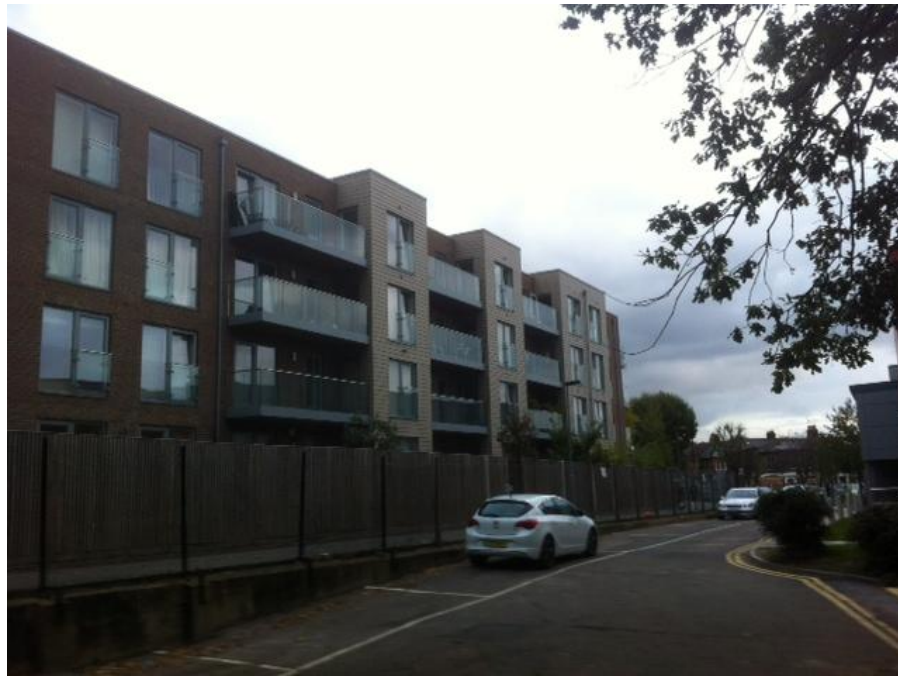
Fuller Court flats