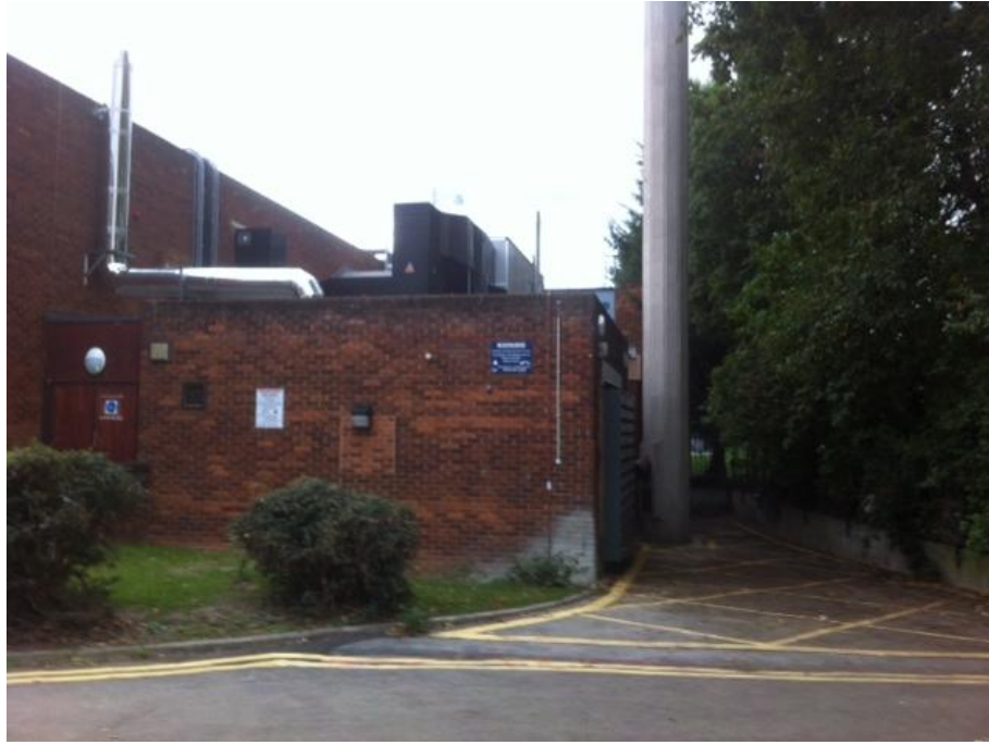
Location of boiler flue