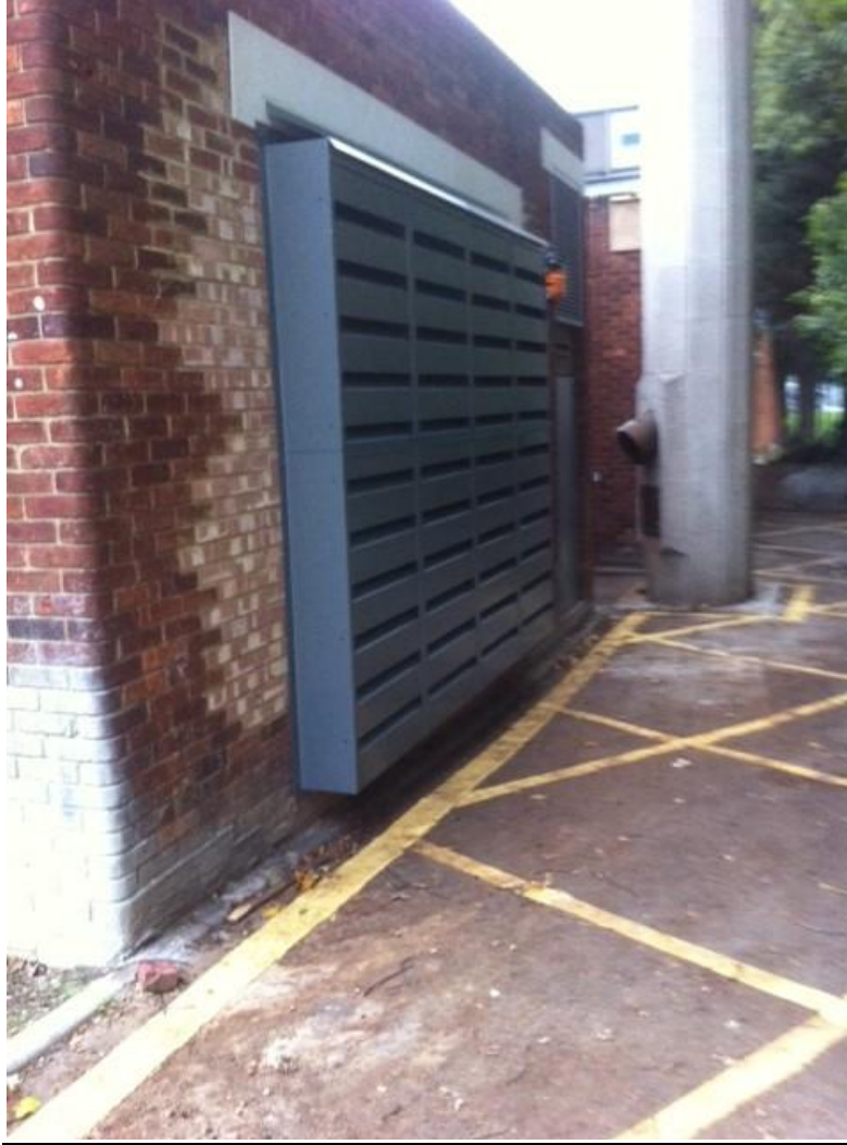
Acoustic louvre to back of plant room